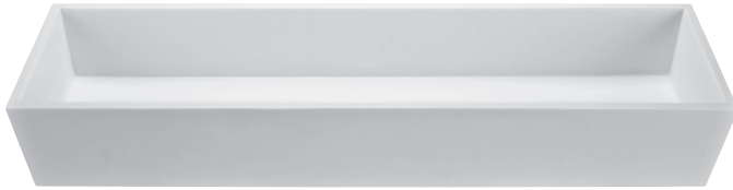
Petra 5 is a single-drain vessel style sink. For dual drain, see Petra 6, MTCS-743.