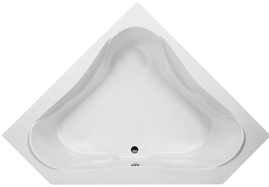
Features a textured bottom standard