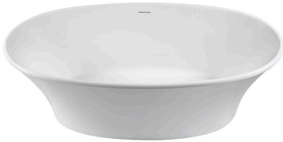
Features an integrated overflow.

NOTE: Filling this tub to the maximum may require an above average size or dedicated water heater.