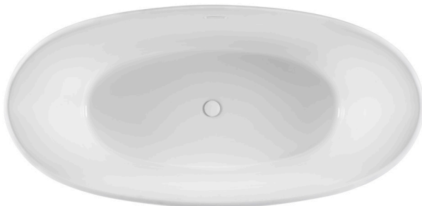
Inside view of tub