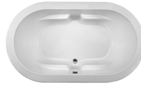
Shown with optional integral armrests