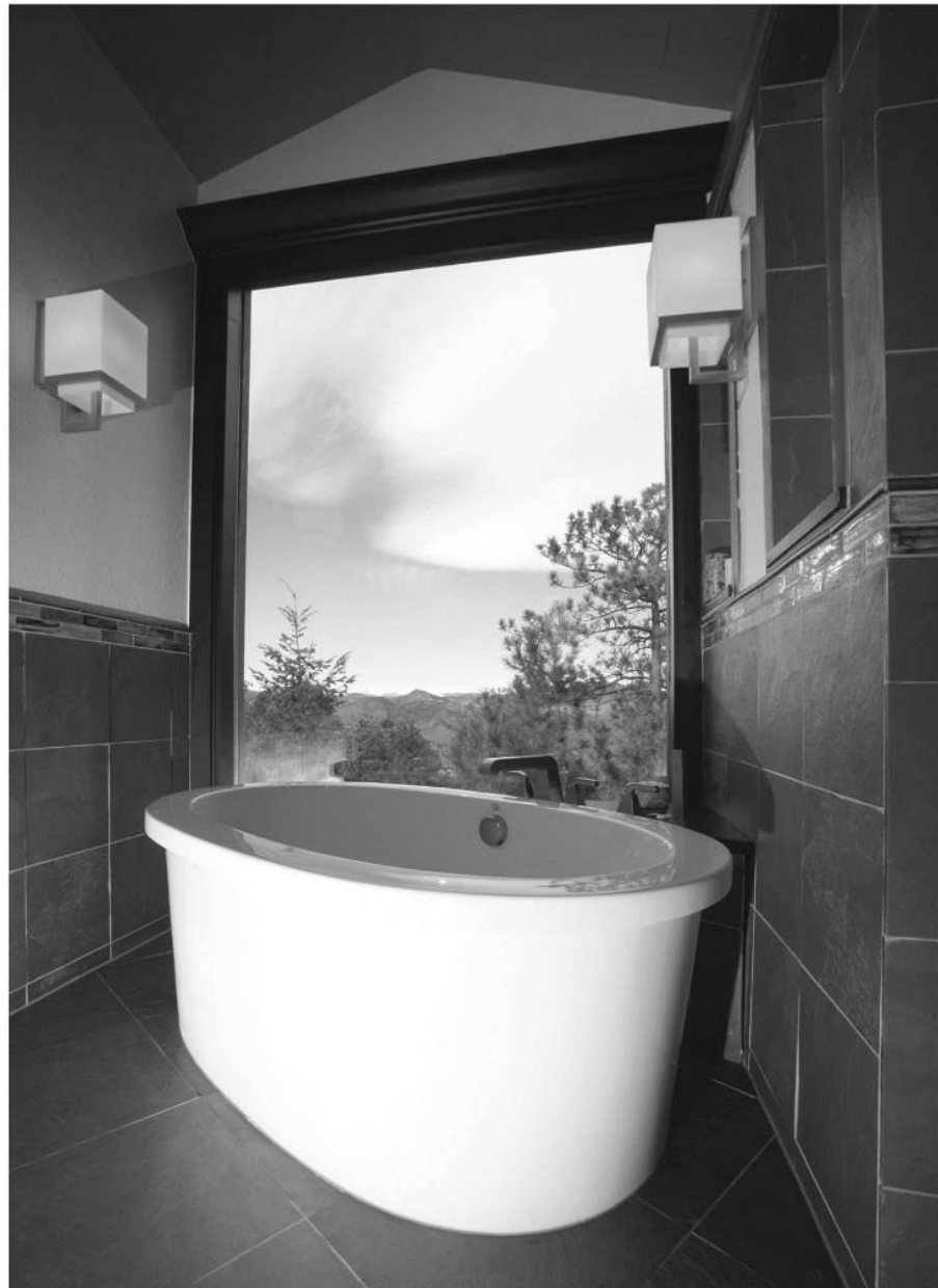
The nearly floor-to-ceiling window gives the homeowner a treetop view of the national forest. The MTI Whirlpools' free-standing Antigua bathing tub adds to the spa-like environment.

The process began by removing the already-large 4'x4' half-round