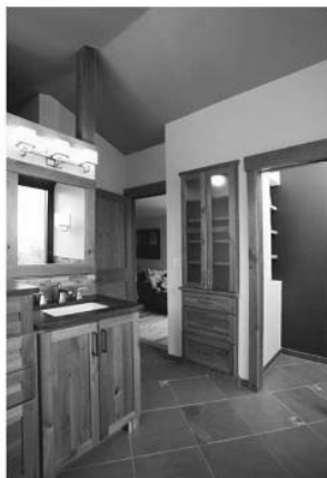
The base and upper cabinet unit built flush to the wall provides storage for towels and linens (left). A Hansgrohe tub filler adds a stylish note to this soothing yet invigorating master bathroom.

"The unique combination of materials, details and installation make this design stand out," she says. "The tile, mixed with glass mosaic and brick and topped with the metal pencil liner, offers a textural difference that stimulates the senses."